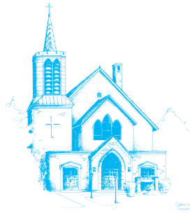
St. Columba & St. Patrick