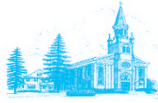
St. Mary of the Assumption