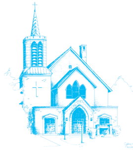
St. Columba & St. Patrick