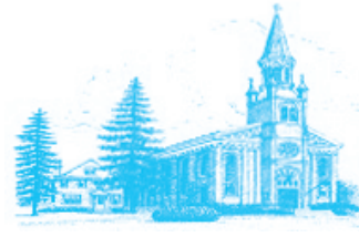
St. Mary of the Assumption