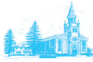
St. Mary of the Assumption