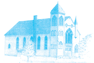
St. Vincent de Paul