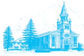
St. Mary of the Assumption