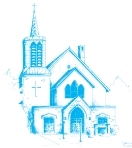
St. Columba & St. Patrick